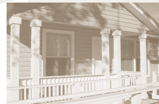
A new home on Byrnes Road